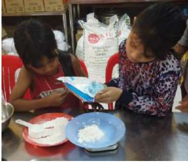
Young children making cookies