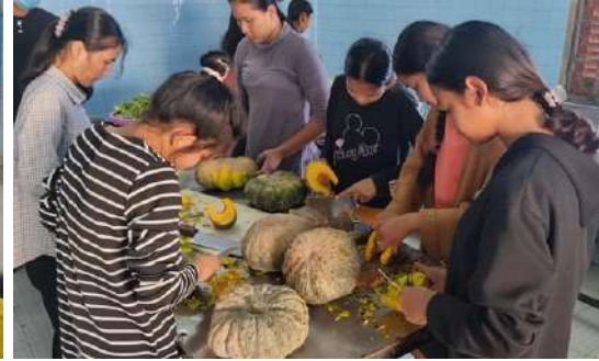
Children helping in kitchen