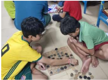
Children playing a board game