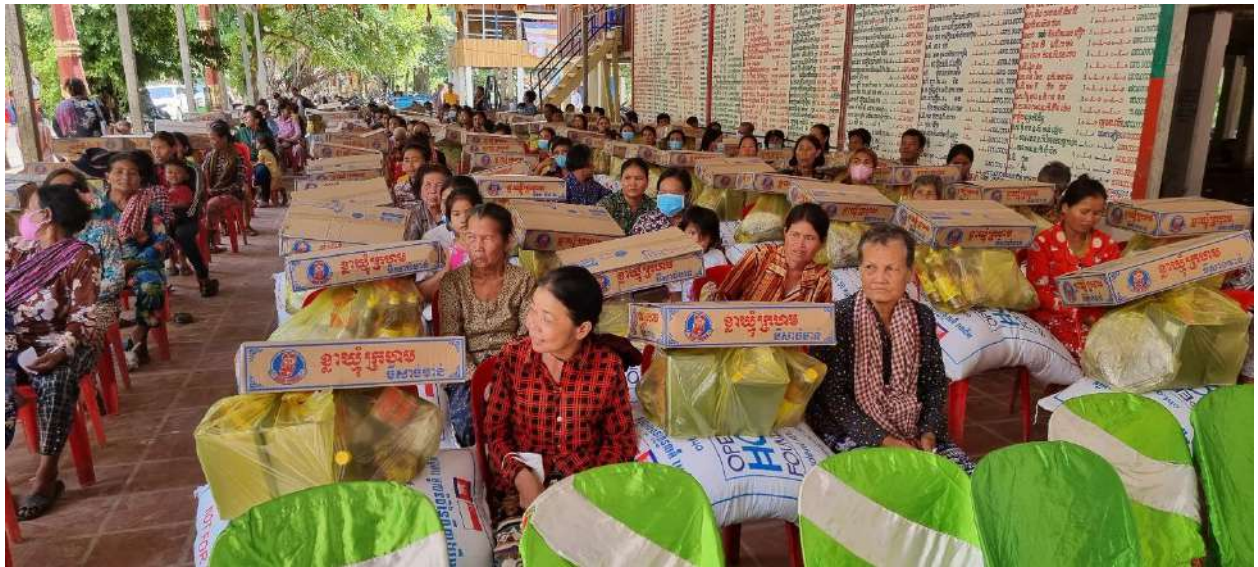
Hundreds of Villagers with large food packs