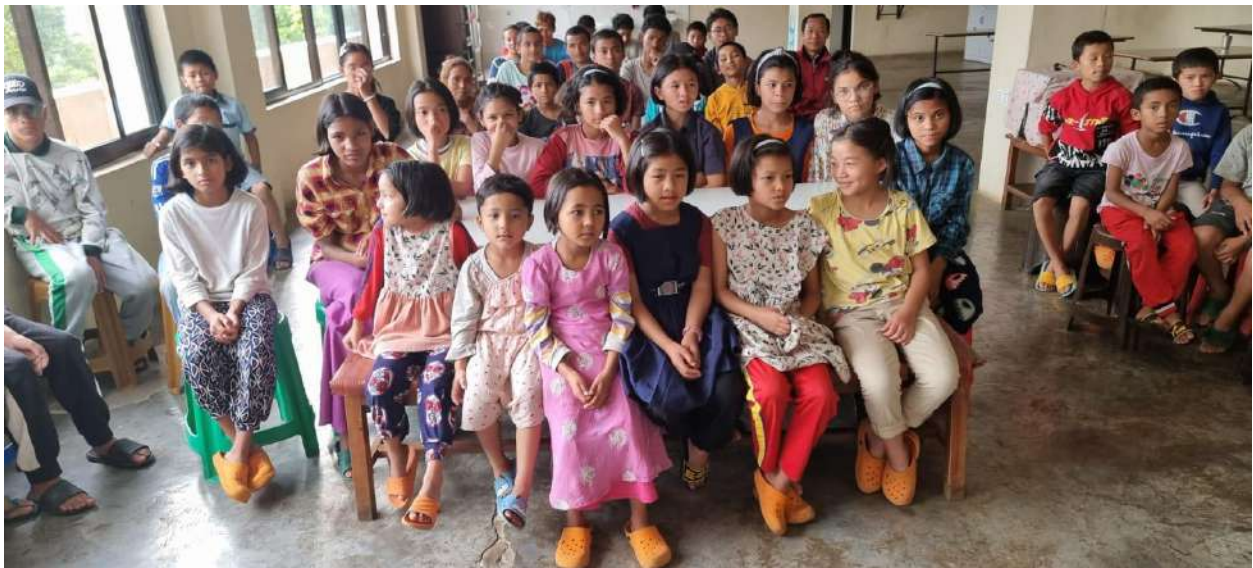
Nepal Advancement children (52 children )

The above are children who stayed in our well fitted and spacious children homes with dormitories, classrooms, dining hall, kitchen, multipurpose hall in Prey Veng, Cambodia and in Kaskikot, Nepal.