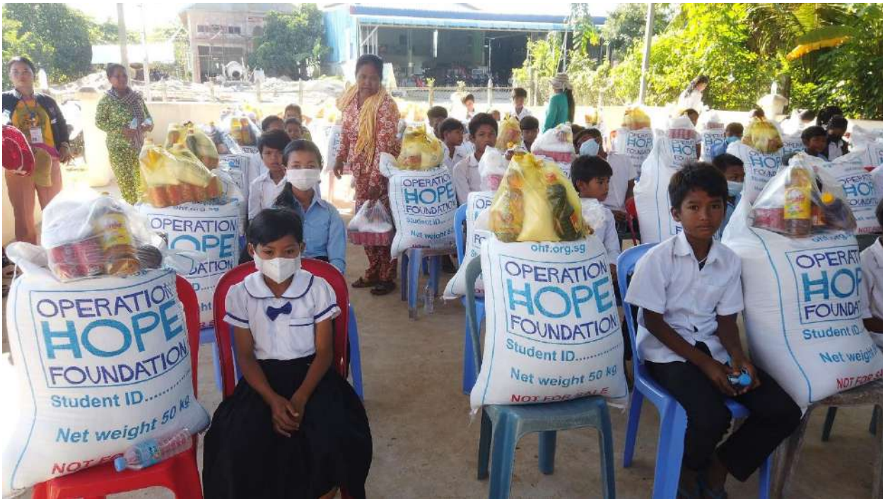
NRCS sponsored child with food pack, 50 kg rice, cooking oil, sauces and canned food