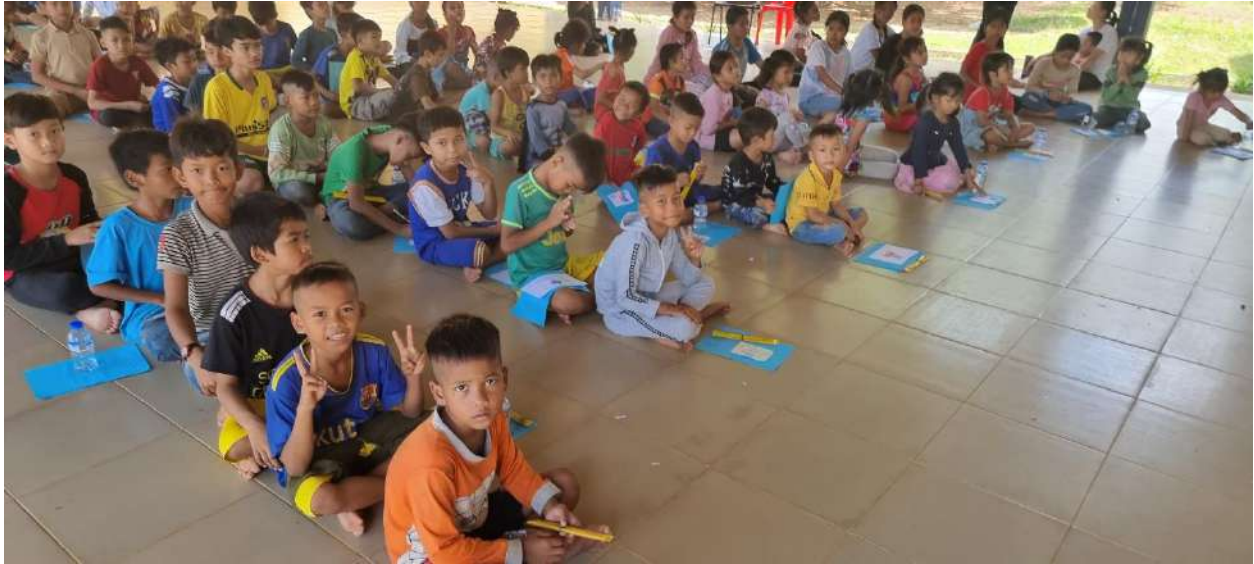
Hope Village Prey Veng (103 children)