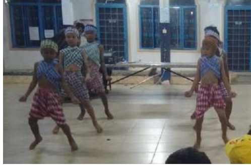
Hip Hop dancing by young boys