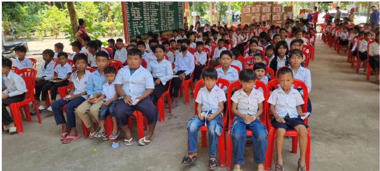
Children waiting for their toy packs!