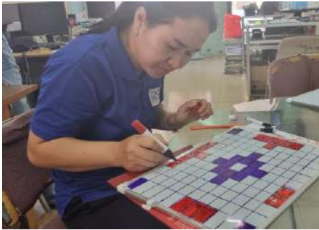
Staff making board games