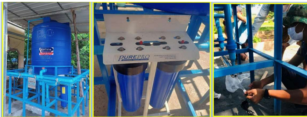
Clean Water System with UV treatment

Education is a priority. We have invested in school infrastructure, including the installation of ultraviolet water systems. These systems provide students with safe drinking water, improving their health and well-being.