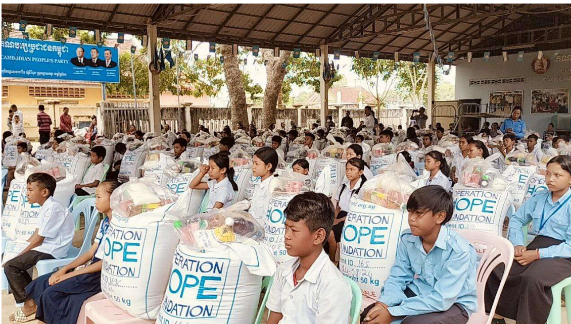
NRCS child with 50KG rice and other food necessities (cooking oil, sauces, canned food etc)

There is a high dropout rate for poor students as they skip classes to earn money for food. Going to school can be expensive for poor families as uniforms, textbooks and stationeries can be unaffordable. We have 185 sponsors but need more sponsors as there are still many poor students who need our support.