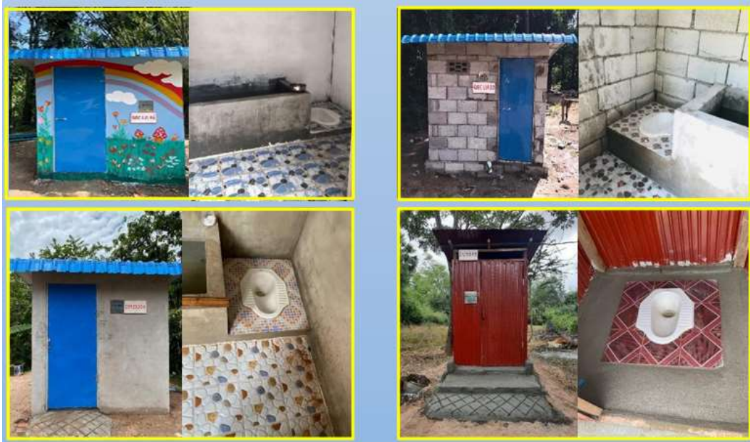
Zinc and concrete toilets

Sanitation is another critical concern. The lack of proper toilets can lead to serious health risks, as improper waste disposal can contaminate the environment and spread disease. Our efforts have focused on building toilets, which promote better hygiene and reduce the risk of illness for entire communities.