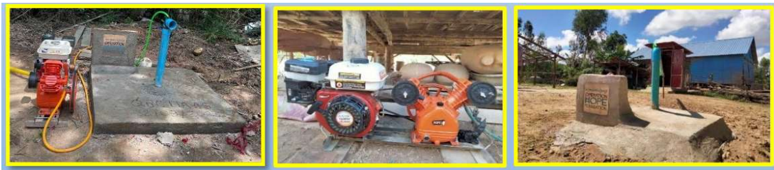
Well with a water pump generator

Access to clean water is a fundamental human right. Many villages lack government-provided piped water, forcing residents to rely on contaminated sources like rivers or ponds. For those without wells, the burden of fetching water falls disproportionately on women and children, who often carry heavy pails for long distances. By constructing wells, we have not only provided a reliable source of drinking water but also enabled villagers to improve their hygiene and increase their income through vegetable cultivation.