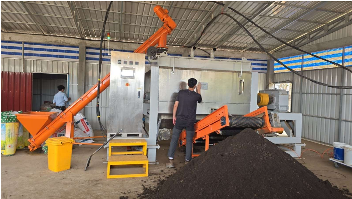
Commissioning of machine with first batch of output.

We are excited to announce the purchase of the S$266,000 Biomax Machine. This new technology, which can produce 1,000 kilograms of organic fertilizers within 24 hours from discarded vegetables, fish parts, rice husk, and duck manure, will generate income as well as providing low-cost organic fertilisers to the local farmers in Cambodia. Prey Veng is an agricultural province.