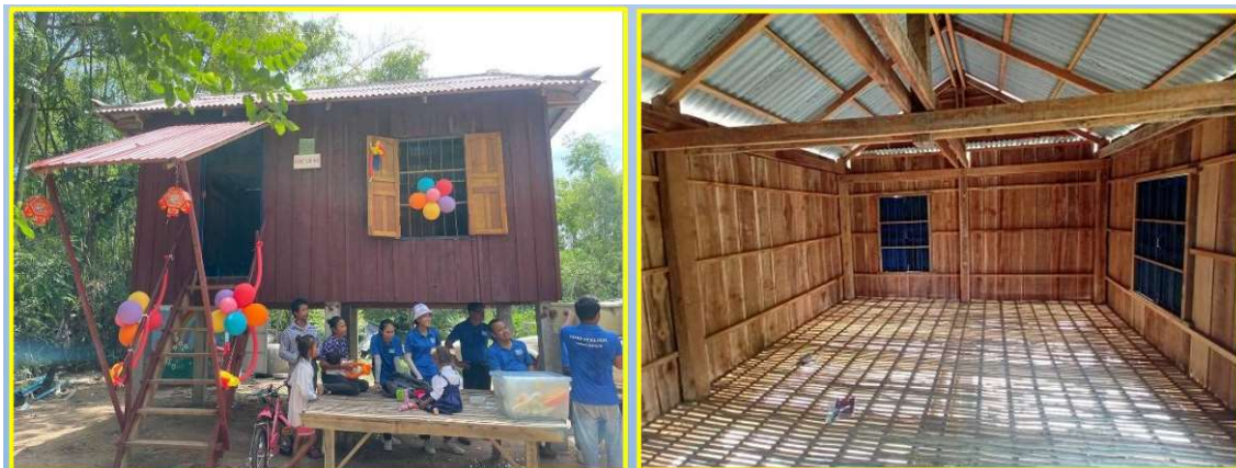
A 4mtr x 5mtr Wooden house

Housing is a basic human need. Many families in Cambodia live in substandard conditions, often residing in makeshift structures that are barely fit for habitation. Our organization has worked to provide families with sturdy, weather-resistant homes, transforming their lives and providing a sense of security and dignity.