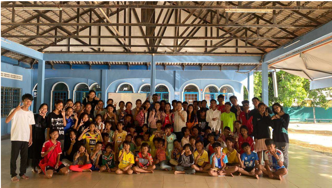
Hope Village Prey Veng