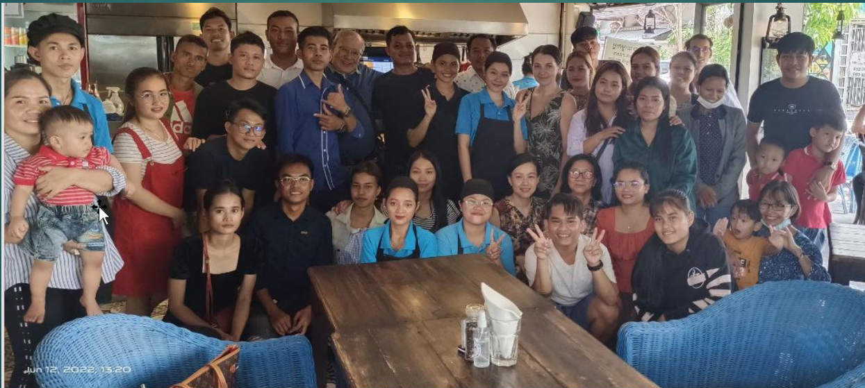
Hope Village Prey Veng Alumni

Pending approval from the Government, we hope to increase the number of children at Nepal Advancement to 100.